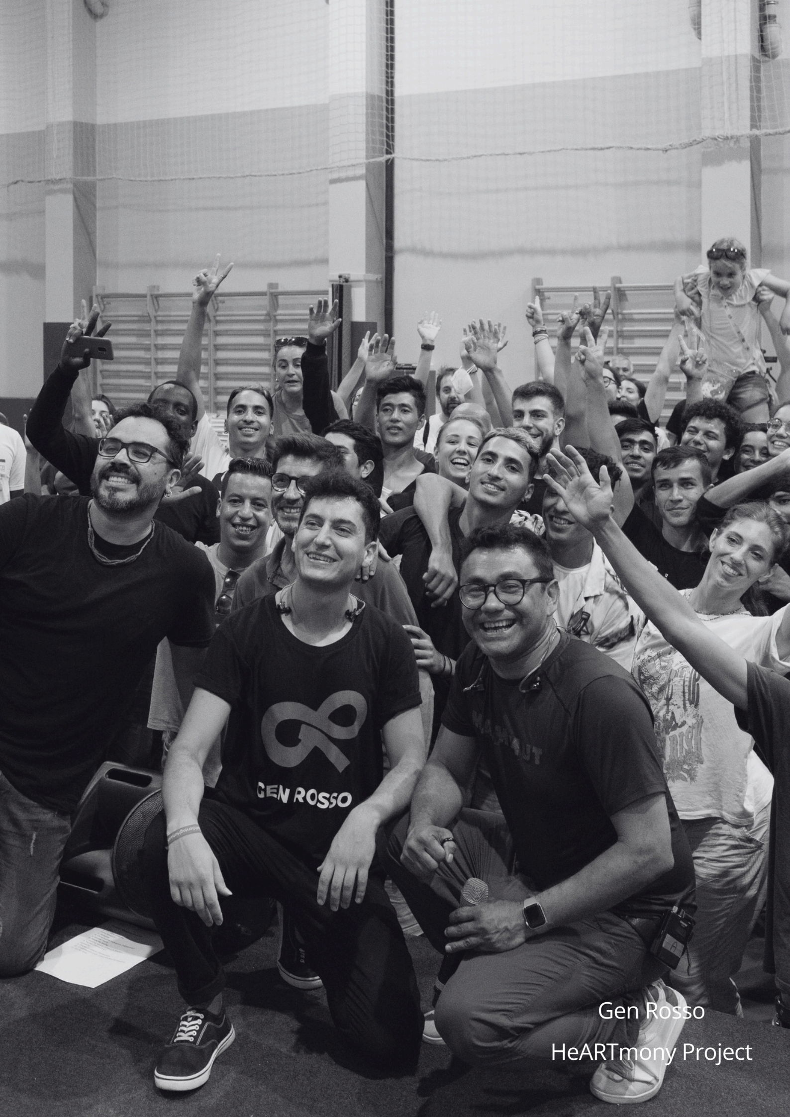
Gen Rosso HeARTmony Project